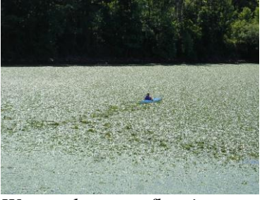
Water chestnut, floating