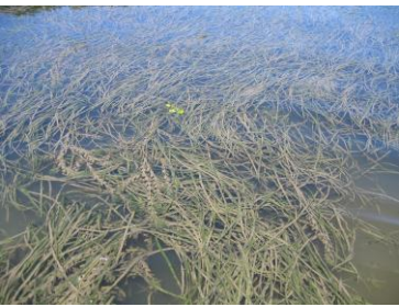
Water celery, submerged